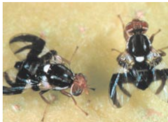
Fig. 1. Apple maggot adults.

Apple maggot adults are known as fruit flies (fig. 1). Female flies lay their eggs singly in apples and other fruits. This egg-laying activity begins in July and continues through early October. When laying each egg, the female makes a tiny puncture in the fruit and inserts the egg just below the skin. This initial fruit damage is easily overlooked, but eventually leads to fruit dimpling (fig. 2).