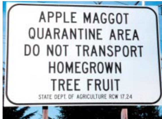
Fig 6. Apple maggot quarantine sign along highway.

some Washington routes read: “Apple Maggot Quarantine Area/ Do not transport home-grown tree fruit” (fig. 6). These signs are part of an educational effort to discourage homeowners and consumers from transporting backyard apples and fruits that may be infested with apple maggot. It is illegal for anyone to carry backyard or noncommercial tree fruit north into western Canada, south into Oregon or across the Cascade Mountains into the apple-maggot-free areas of eastern and central Washington. For more information on these quarantine programs, contact the WSDA at 1-509-225-2609.