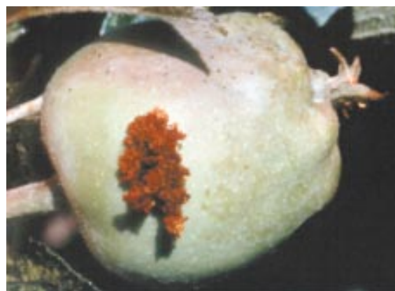
Fig. 8. Codling moth larvae leave granular brown excrement around entry hole.