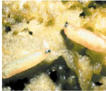
Fig. 3. Apple maggot larvae.