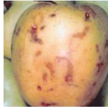
Fig. 4. Fruit damage created by tunneling apple maggots.

Apple maggot eggs hatch in 3 to 7 days as small (less than \frac{1}{16} inch), cylindrical, cream-colored larvae known as maggots. Maggots lack legs and visible head capsules, but have dark mouth hooks that protrude from tapered heads (fig. 3). As apple maggots tunnel through the apple flesh, they leave characteristic winding brown trails (fig. 4) that are best seen when the fruit is cut open (fig. 5). The first indication that a backyard apple tree is infested with apple maggot occurs when the homeowner discovers these brown trails in fruit at harvest. The maggots measure \frac{1}{4} inch long when fully mature. Fruit damaged by apple maggot becomes soft, rotten, and often drops from the tree.