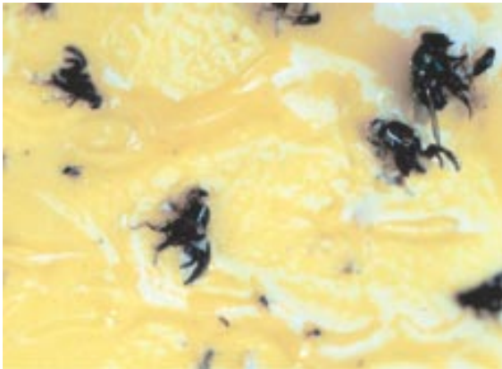
Fig. 10. Apple maggot and other flies captured on a yellow sticky trap.

wintering sites in the soil and fly into apple trees. Typically, growers and home-owners monitor for apple maggot flies to time their insecticide spray program. Most spray programs start within one week after the first apple maggot fly is captured.