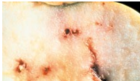
Fig. 5. Cross-section of an apple infested with apple maggot.

Authorities suspect that the apple maggot is transported and spread as maggots or eggs within infested fruit. To prevent further spread, quarantine areas are established around counties that have known apple maggot infestations. Highway signs posted along