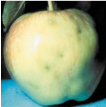
Fig. 2. Damage from apple maggot egg-laying activity.