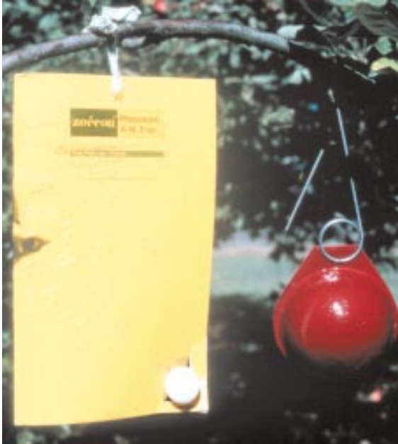
Fig. 9. A yellow rectangular sticky trap with an ammonia lure or a red spherical sticky trap work best for trapping apple maggot flies.