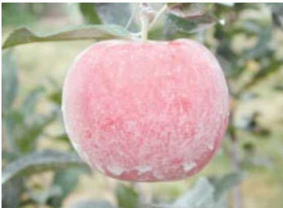
Fig. 11. A visible kaolin clay film must cover apple to be an effective insect deterrent.

One product homeowners may consider using for control of apple maggots is a kaolin clay (Surround At Home®). This clay product is not a true pesticide and is not toxic to apple maggot or other insects. These products form a barrier film that irritates insects and disguises the host. Insect pests avoid the kaolin-treated trees and fly to other potential host trees. Kaolin clay works best when the visible film barrier is established over the entire tree before fly activity begins. Begin applying kaolin clay by late June and reapply every 7 to 14 days, or more frequently if it rains, to maintain a good visible film on the apples (fig. 11). You can monitor apple maggots with sticky cards and begin applying kaolin at first fly catch. Apply Surround At Home® at a rate of 1/2 pound (about 3 cups) per gallon of water and spray onto tree until the product begins to drip from the leaves. Use enough product