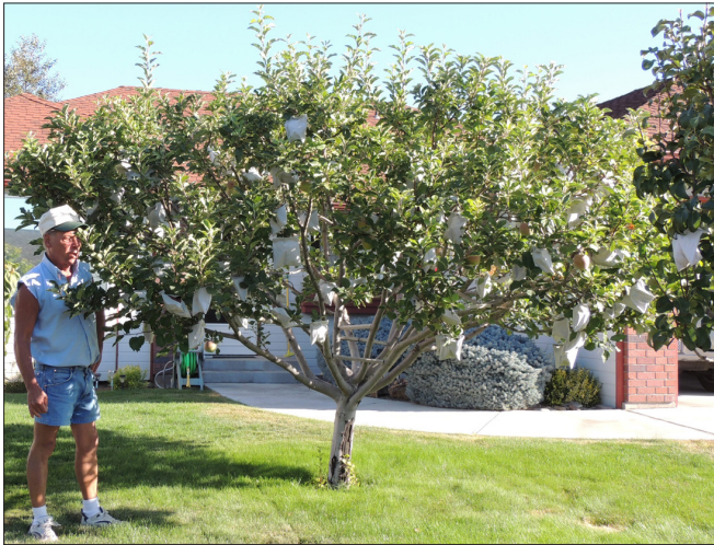
Figure 5. An apple tree grafted on a semi-dwarf rootstock. The tree height is maintained at 10 to 12 feet.

overall tree size is best maintained by proper training and pruning. Even standard-sized trees (30 to 40 feet tall) that have been grafted on seedling rootstock can be maintained to a height of 10 to 12 feet through annual pruning and training (tying down) of upright limbs.