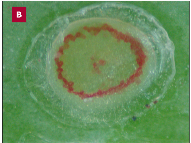
Figure 2. A) Codling moth eggs are laid singly on fruit or on leaves near the fruit. B) As the egg matures (in about a week) it will develop some internal color and the dark head capsule of the larva will be visible.