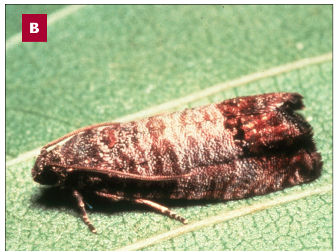
Figure 1. A) The adult codling moth is only about 1/2 inch in length. B) It is recognizable by the alternating gray and brown bands and the darker coppery brown patch at the wing tips.