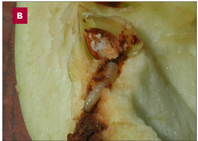
Figure 3. The larvae damage fruit by boring to the core and feeding about the seeds.