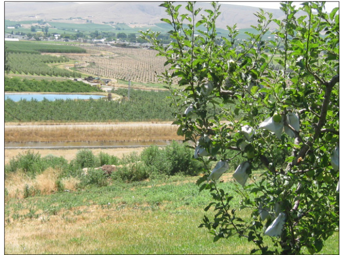
Figure 6. An apple tree with bags protecting fruit from codling moth.