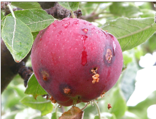
Figure 4. Apple fruit with signs of codling moth infestation.

Washington homeowners must protect their apple or pear fruit from two, or sometimes three (in the warmer regions of the state) generations of codling moth each year. The adult moths fly during warm evenings, with peak activity in May, July, and late August. The best means of protecting backyard fruit trees from codling moth infestation is an integrated pest management (IPM) program utilizing several control strategies.